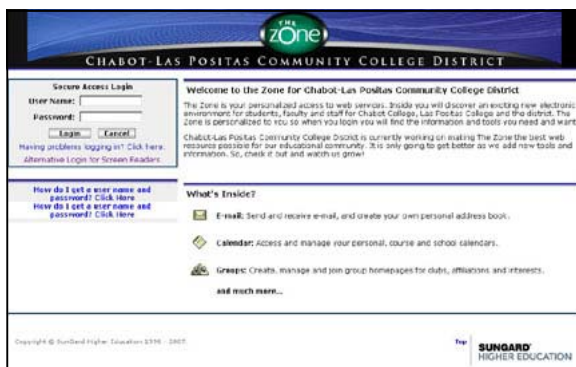
Chabot-Las Positas Community College District

THE ZONE has a Home Tab for all users where personal announcements appear based on the role of the individual and where campus or district announcements are distributed.