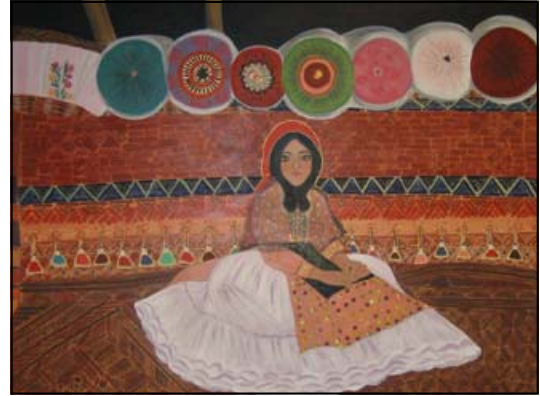
Artist: Soussan Farsi Title: Qashqai Girl Medium: Acrylic and Oil on Canvas

Las Positas College students and members of the Las Positas Art Club accepted an invitation to exhibit a variety of art mediums and subjects, bringing beauty and interest to the halls of the district office. The District Office extended the invitation to display art to both Chabot and Las Positas Colleges. Artwork from Chabot College will be displayed in 2009 and will include illustrations, ceramics, and paintings (acrylic and oil). The District Office is delighted to display these beautiful works of art created by our students. Many of the pieces are for sale and can be purchased directly from the artist. The current display will be on display through February 2009.