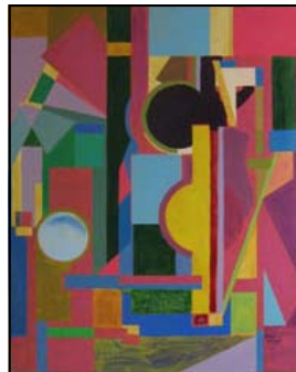
Artist: Jason Zadwick Title: Big Abstract Medium: Acrylic on Canvas