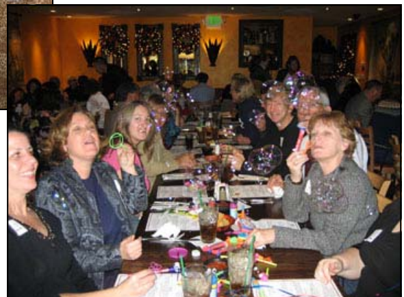
Staff from Chabot and Las Positas Colleges enjoy the festivities.