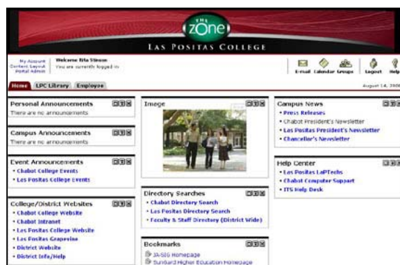
Las Positas College