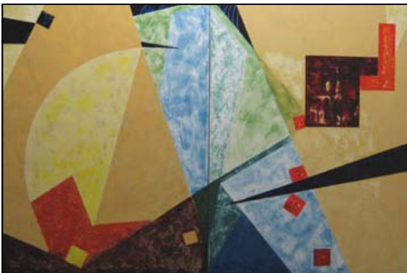
Artist: Nicole Wakeman Title: Cirque Solar Medium: Acrylic on Canvas, 2 pieces diptych