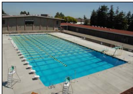
Chabot Aquatic Center