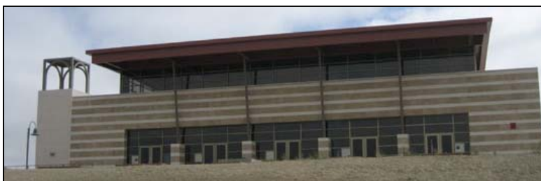
Las Positas Mutli-Disciplinary Building

The new Las Positas Mutli-Disciplinary building opened to faculty, staff, and students on June 11. At 36,757 square feet, the building includes seven classrooms, a 204-seat lecture hall, faculty offices and a learning center for students. Each classroom is equipped with state-of-the-art technology to provide students with the resources and opportunity to maximize learning. The building is divided into four areas: instructional, professional, public and private. The new building is not only functional and conducive to learning, but it is a beautiful area that students can enjoy. The breathtaking view of rolling hills and vineyards provide a great social and intellectual atmosphere for Las Positas students.